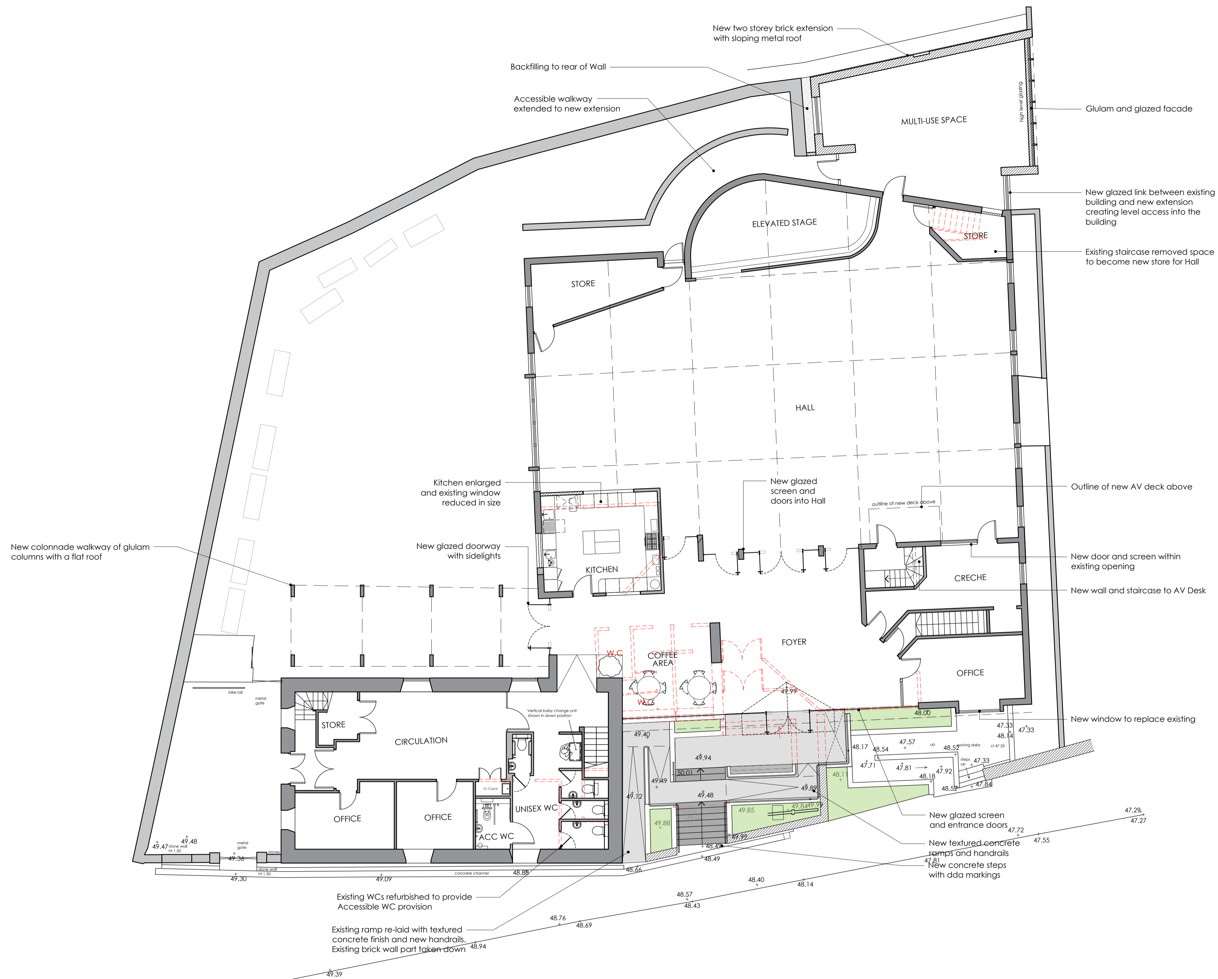
Proposed Ground Floor Plan 1:100